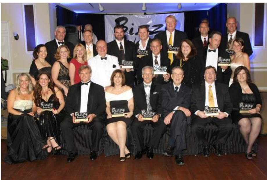
2010 Bizzy Award Winners

The 5th Annual Bizzy Awards was held Thursday night, September 30th at the beautiful Inn at Pocono Manor. There were 72 entries in 12 categories submitted this year, and over 185 people were in attendance. This year's event was sponsored by, ActionCOACH, AAA North Penn, Best Auto Service Center, Adams Outdoor Advertising, Inn at Pocono Manor, Blue Ridge Communications, Dawn of New York, Richard Henry Construction, Visual Sound and WebLeaps. Pictures taken during the event