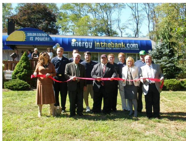
Energy in the Bank