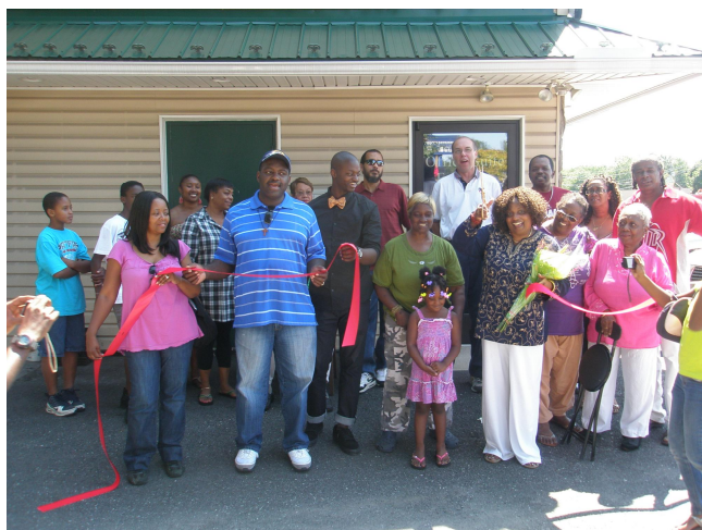
Time to Thai Massage