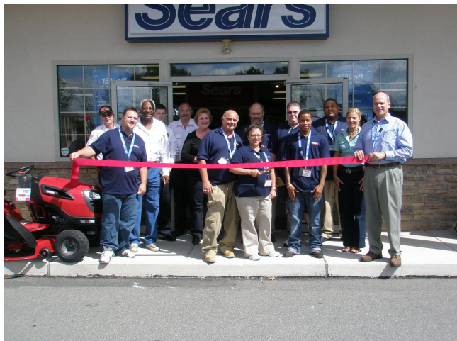
Sears Hometown Store