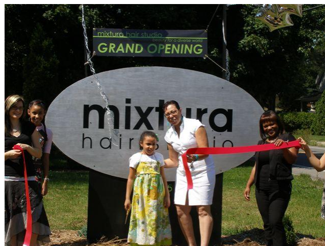
Mixtura Hair Studio

Mixtura Hair Studio , located at 1655 W. Main Street in Stroudsburg, held a Grand Opening celebration on Saturday, August 28. The Greater Pocono Chamber of Commerce assisted with a ribbon cutting ceremony. The studio works with the health and maintenance of all hair textures in a comfortable, friendly atmosphere. Their services include haircuts and styles for men, women and children. For more information, please call 570-730-4949 or visit the website at www.mixturahairstudio.com .