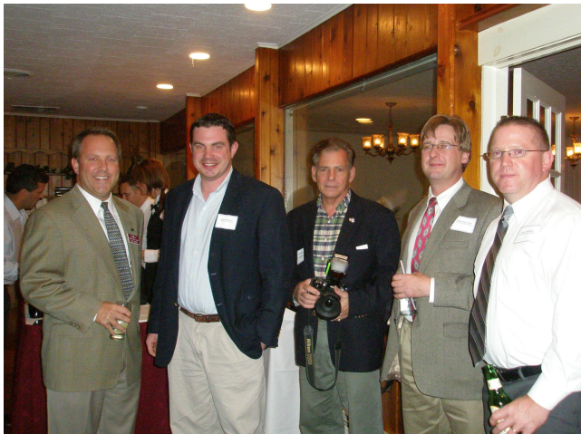
September Business Card Exchange at Blakeslee Inn

On Monday, September 13th, Blakeslee Inn hosted the September Business Card Exchange. Everyone in attendance enjoyed the beautiful facility along, with networking and sampling the wide array of butlered food.