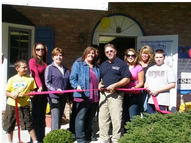
Aardvark Cleaning Company

Aardvark Cleaning Company celebrated the Grand Opening of their new location with a ribbon cutting ceremony on September 18. Aardvark is located in Carriage House Square, Route 115 in Effort and specializes in office cleaning, vacuum cleaner sales and service, and "dry" carpet cleaning. For more information, please contact Mike Sollitto at 570-629-8652 or visit the website at www.aardvarkcleaning.net .